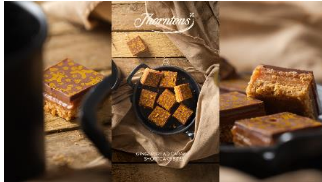
Pictured above: Thornton's Gingerbread Caramel Shortcake Bites

Christmas classics have been revisited and revamped in line with current trends and customer demands and include the Christmas classic Yule Log and Chocolate Celebration Cake from Baileys, as well as Baileys Red Velvet Brownies and Thornton's Gingerbread Caramel Shortcake Bites.